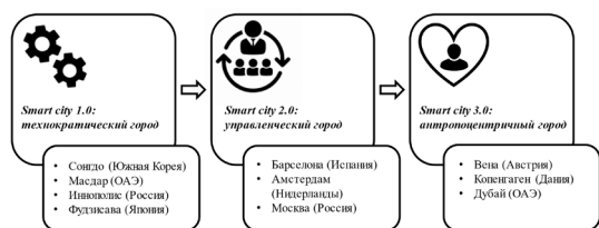
Figure 1: Evolution of smart city generations.

Most researchers distinguish three generations of "smart cities": Smart city 1.0, Smart City 2.0 and Smart City 3.0. This approach largely reflects the actual state of a given city where the corresponding changes have occurred. Figure 1 shows the phases of "smart city" development.